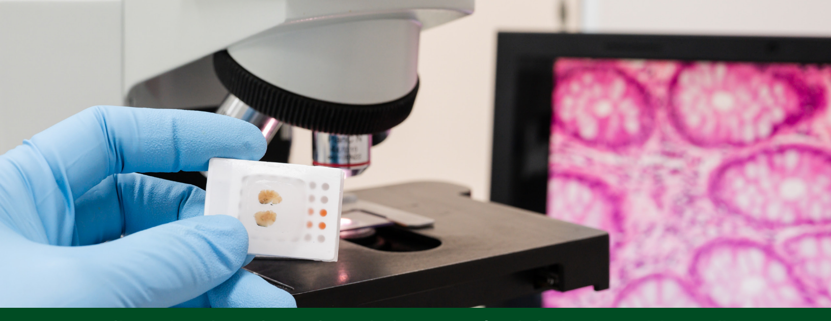
Here's a glimpse into the evolving roles and advantages of pathologists in precision medicine.